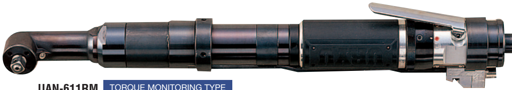
UAN-611RM TORQUE MONITORING TYPE

Instant automatic shut-off providing reduced reaction. Low inertia design providing increased accuracy.