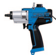
Top Load Type